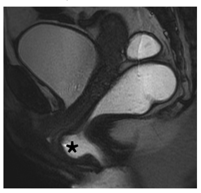
Figure 2: MR defecography image during the last cine imaging. Despite repeated attempts of defecation, the patient could not empty the rectum. Also note the small rectocele (asterisk)

The exact etiology of anismus is unclear; mechanical causes like childbirth, history of sexual abuse or psychological disorders like anxiety, depression have been described as possible predisposing factors. The real incidence of this functional disorder is not clear, and there is a not a reference standard