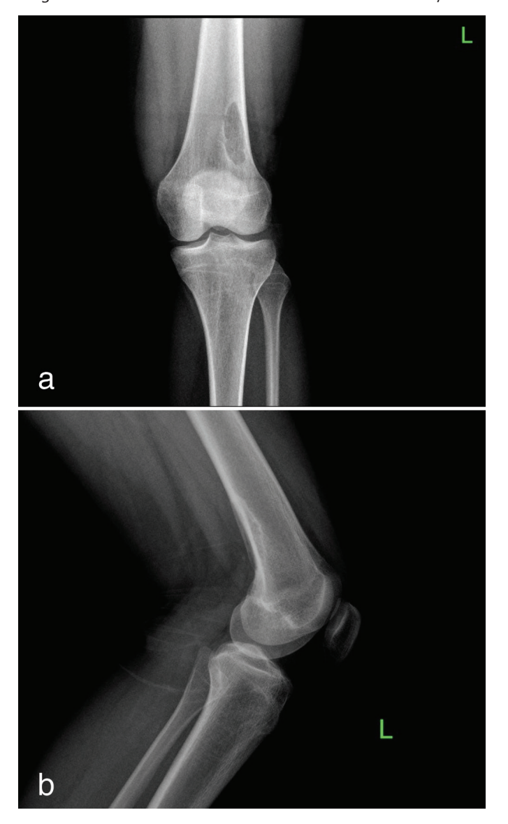
Figure 1: Knee radiographs of a 15-year-old patient's non-ossifying fibroma of the distal part of the femur (stage A)

We found less frequent additional three types of benign bone tumors in our study population. In two patients, it was fibrous dysplasia which is characterized by poorly organized irregular woven bone in a fibroblastic stroma. Solitary ones