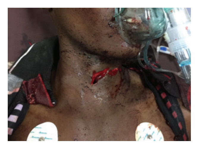
Figure 1: First application

A 36-year-old male patient was referred to our hospital from an external center after suffering from a traffic accident. On physical examination, the patient was dyspneic and tachypneic, the tension was stable and the pulse was tachycardic, SpO<sub>a</sub> was 94%. On the neck, there was an approximately 8 cm long horizontal incision extending into the left side of the trachea. There were also cuts extending to the left side of the face at the deepest point of the skin and subcutaeous tissue in different sizes. There was wheezing during respiration and air leakage by coughing from the cut positioned in the midline of the neck. When the incision in the neck was partially explored, it was seen that the trachea was cut due to trauma to the penetrant (Figure 1). Laboratory findings did not reveal any pathologic value other than partial hemoglobin decrease. Thorax computed tomography showed that trachea integrity was lost in the anterior portion of the proximal trachea (Figure 2). The patient was operated on emergency conditions. During the operation, it was observed that the cartilage portion of the trachea was severed completely and membranous portion was ruptured at 1/3 of from the right side. The trachea was repaired by suturing the membranous parts continuously and the cartilage parts