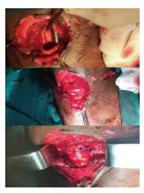
Figure 3: Operation pictures

sufficient anamnesis, physical examination and radiological findings in these patients, bronchoscopy must be performed under the appropriate circumstances. Conditions on when, and to whom the bronchoscope should be performed are controversial (4). It should be kept in mind that small penetrating lesions may not be symptomatic and difficult to detect radiologically. We detected cervical tracheal injury in our physical examination, that's because we applied surgical treatment first. The most common physical examination findings in penetrating traumatic tracheal injuries are shortness of breath, hoarseness, respiratory failure, subcutaneous emphysema, hemoptysis, if there is a skin defect air leakage from skin defect and prolonged air leak in patients with chest drain (5). In our case, partial subcutaneous emphysema, hoarseness and air leak at the incision site were present. The crucial thing is surgical intervention of the injury as soon as possible after resolving life-threatening traumatic problems in complicating penetrating injuries. The principle of surgical repair is debridement of tracheal ends and anastomosis of every tip with each other by using non-absorbable sutures (5). Also, non-absorbable polypropylene suture material can be used for anastomosis after debridement in trachea and the cricoid area. The choice of incision is important according to