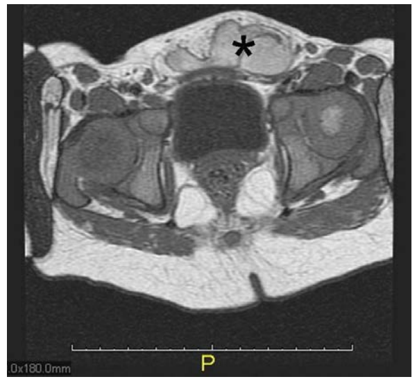
Figure 1: Magnetic resonance imaging scans showing the mass with asteriks

Although lipoblastoma is a rare entity in inguinal masses, it is important to consider them in the differential diagnosis of a prepubertal child with inguinal mass. Complete surgical excision is important to prevent recurrence and a minimum two years of follow-up is recommended in these patients. Recently, karyotype analyses have also been used in the differential diagnosis of lipoblastomas and liposarcomas.