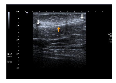
Figure 1: A hyperechoic linear object within the right breast demonstrated on the gray scale US