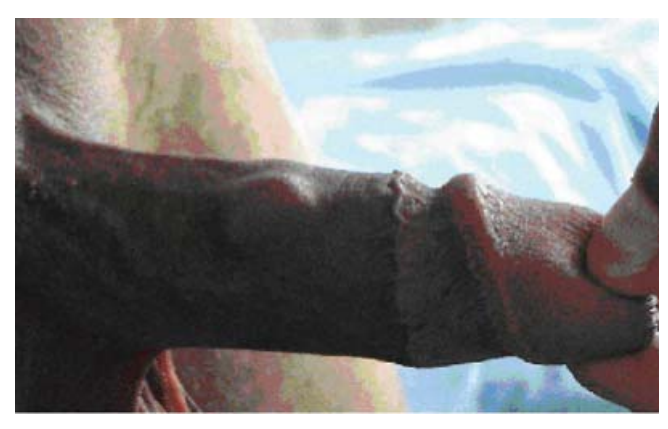
Figure 1. Macroscopic image of the patient's penile schwannoma