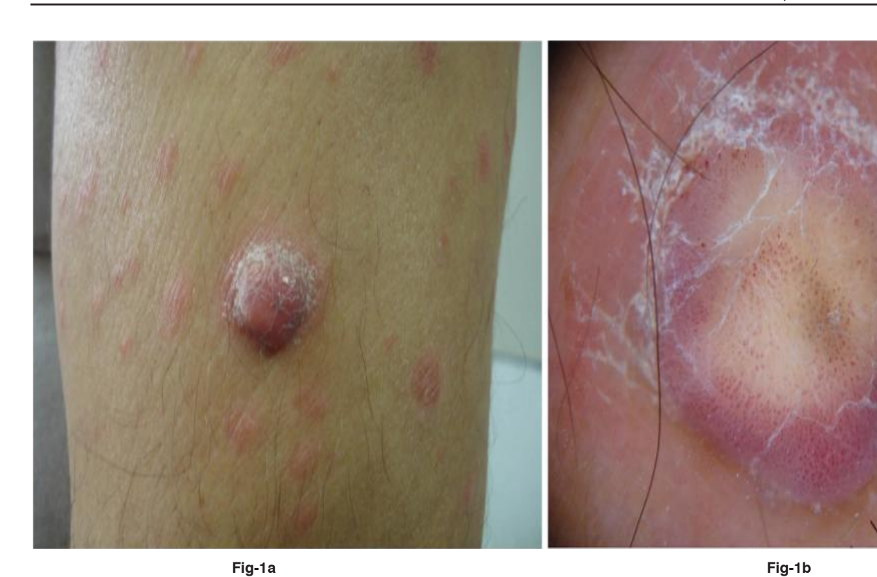
Figure 1a: A 2-cm, firm, pink exophytic nodule with a collarette scaling and erythematous, squamous papules on the left arm. Figure 1b: Erythematous homogeneous area surrounding the white patch. Dotted vessels are distributed throughout the entire lesion, whereas brown dots observed only in the central white scar-like area. There are few hairpin like vessels (documented by DermLite foto)

The nodule was completely excised and histological examination showed a dermatofibroma (Fig. 2a,b,c).