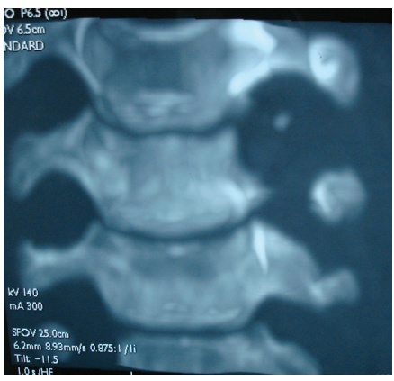
Figure 3: Postoperative 3D reconstruction CT showing total excision.

We report a rare case of osteoblastoma originating from the vertebral body in front of the transverse foramen of C4 with severe vertebral artery compression. The patient was successfully treated by total excision of the tumor.